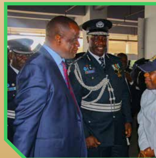
Home Affairs Minister Tours PSPF Stand at Zambia