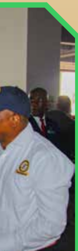
Police Service Day