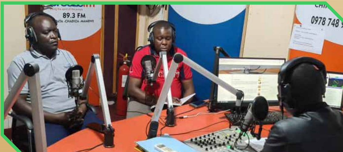
PSPF Staff conducting life certificate radio sensitisation programme in Chipata, Eastern province