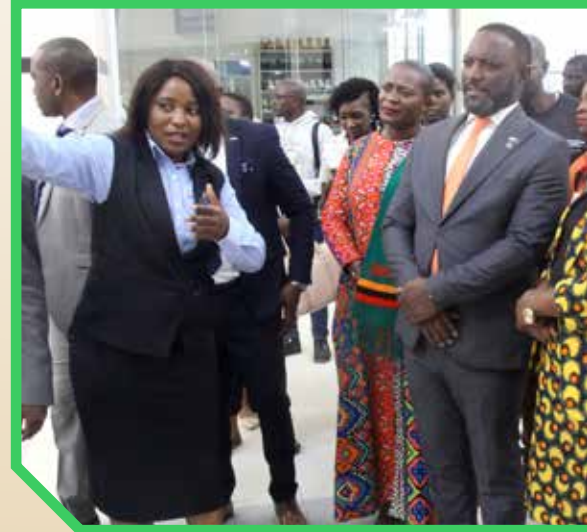
Tourism Minister interacts with guests