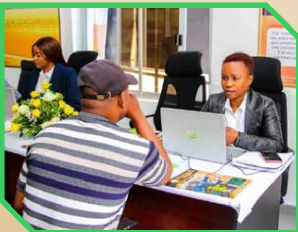
PSPF information desk at the 2023 Agricultural and Commercial Show