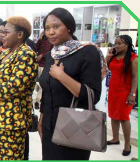
at the KK Day Commemorations