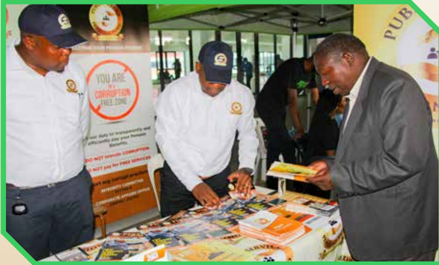
PSPF members visit stand during Zambia Police Service Open Day 2023