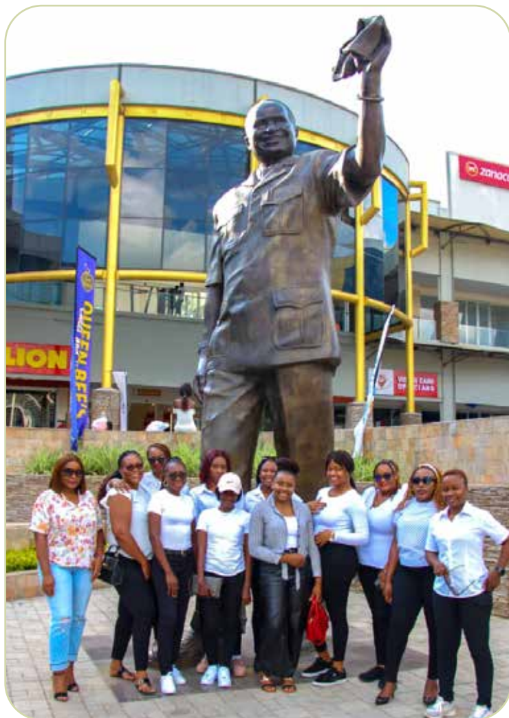
■ PSPF Ladies Pose at KK Square (Longacres Mall - Lusaka)