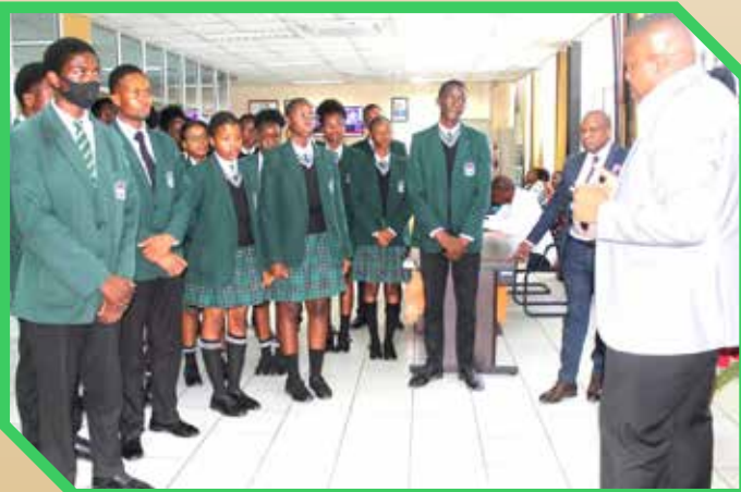
Lusaka's Lake Road PTA School Pupils tour PSPF