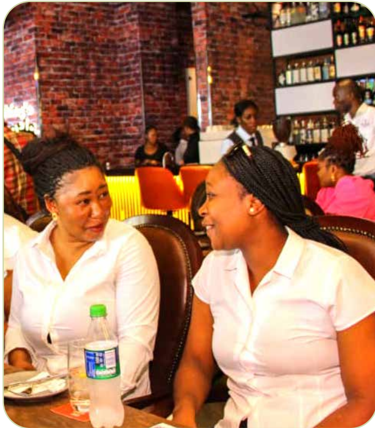
■ Team Building for Ladies on Women's Day