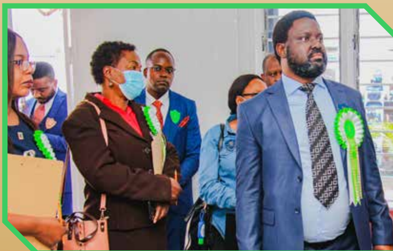
Judges at the 2023 ZITF PSPF Stand