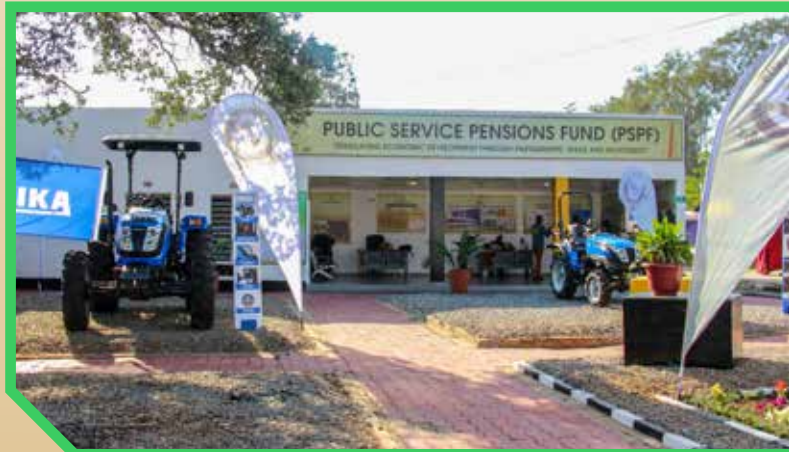
PSPF Exhibition Stand at 2023 ZITF