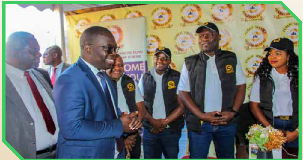
Commerce Minister tours PSPF stand at Africa Public Service Day 2023