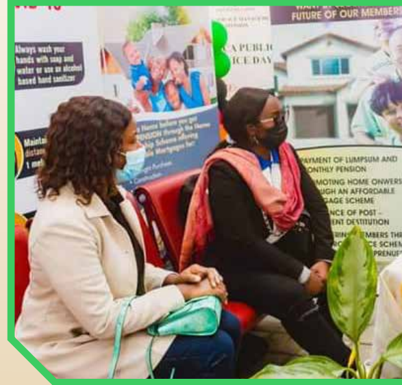
PSPF Members visit the stand during the exhibition