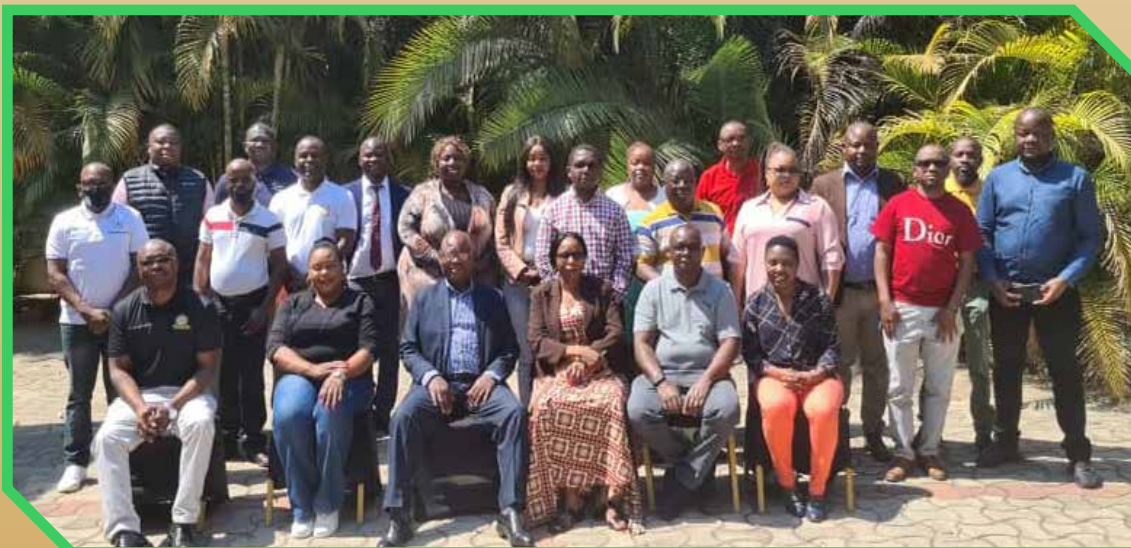
PSPF top management and staff after the Risk Management Training workshop