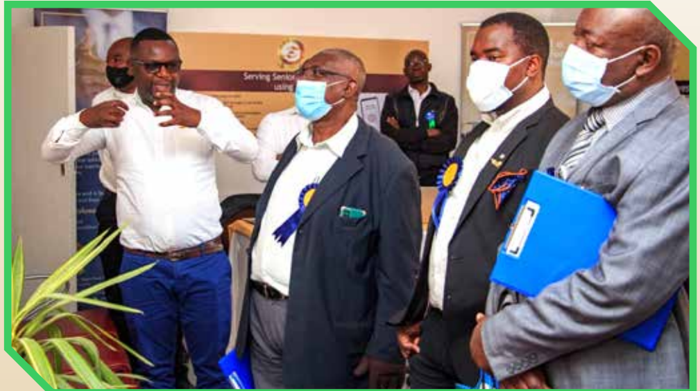
PSPF Loan Officer explaining the theme interpretation to judges at the ZACS 2022