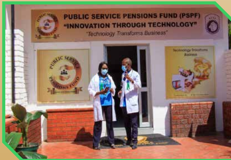
Some of the visitors at the PSPF stand during the 2022 ZACS