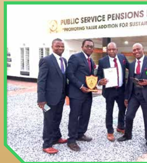
PSPF Staff at ZITF after winning award for innovation