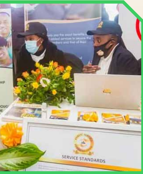
ing the 2022 APSD road show in Lusaka