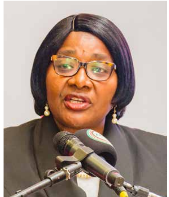
Brenda Tambatamba, Labour Minister