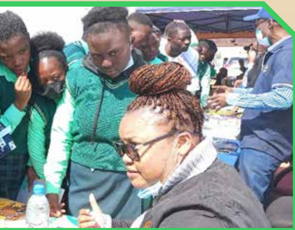
litisation road show in Kanyama Township, Lusaka.