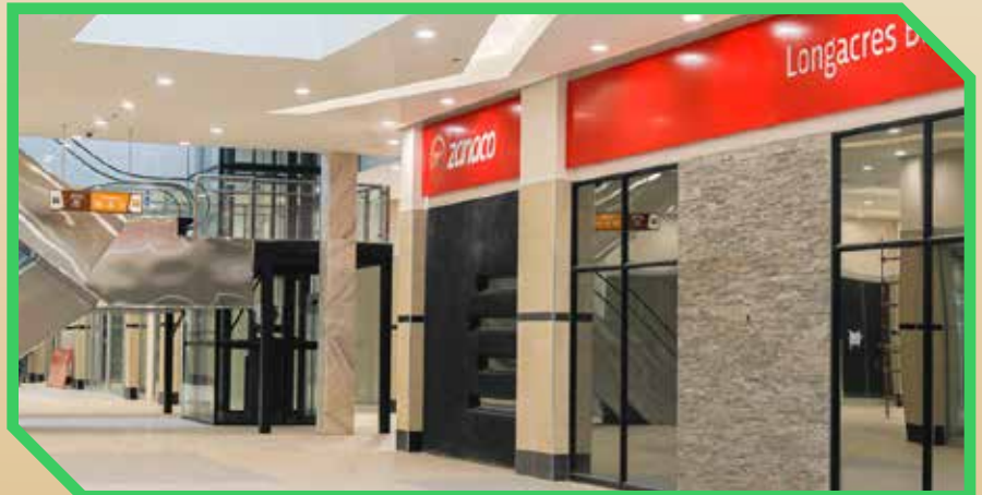
Part of Longacres Mall in Lusaka.