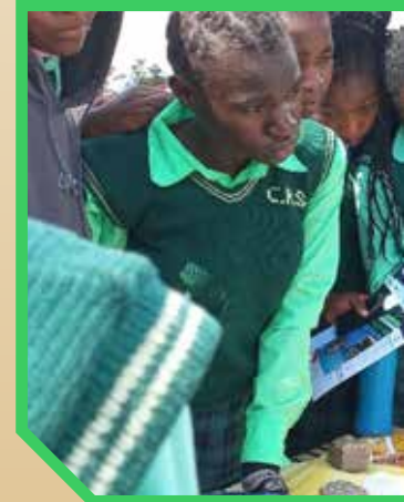
Africa Anti Corruption Day sends message of integrity