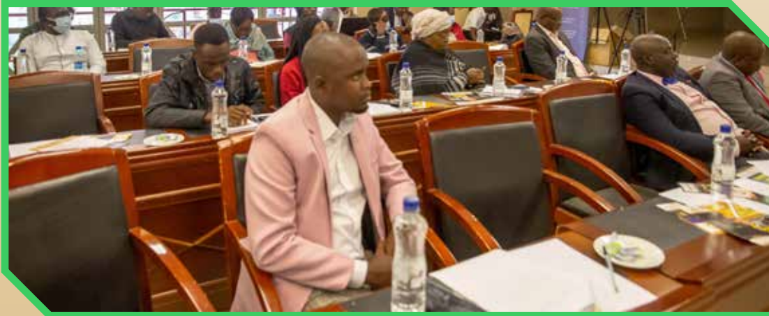
Livingstone journalists doing a Media Engagement Workshop