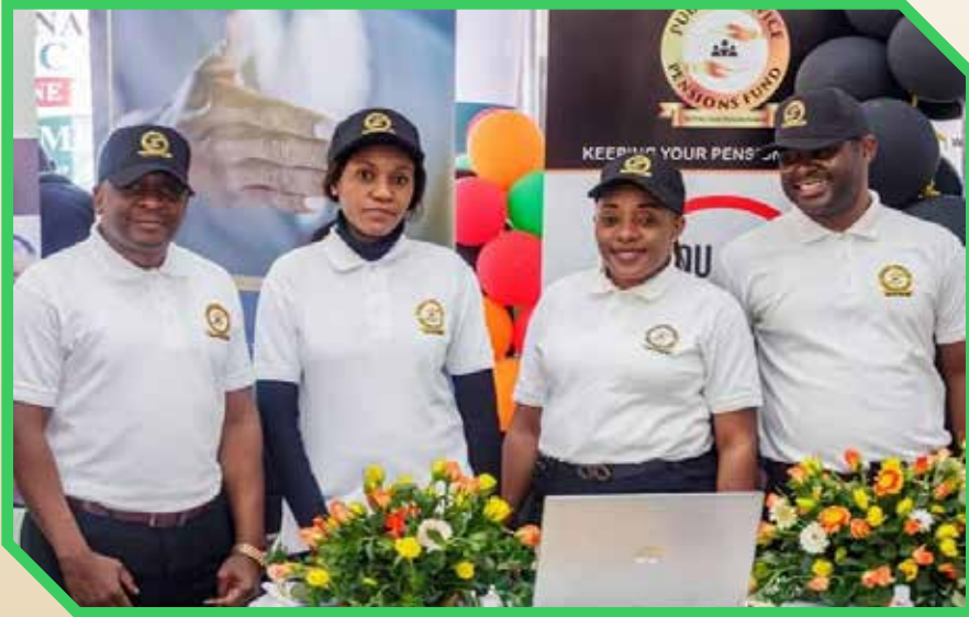
PSPF Staff at the 2022 Africa Public Service Day exhibition